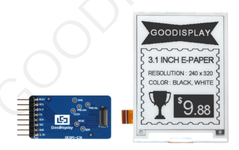
Figure 2: Connection of E-paper display and Adapter

Note: This connector is a rear lock type. When using it, you need to stand up the switch first, insert the E-paper display and then press the switch to lock it.